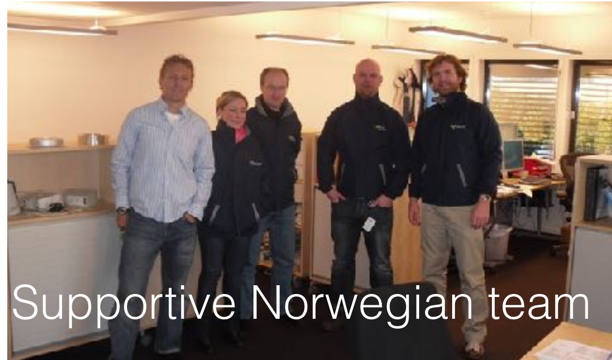
Supportive Norwegian team