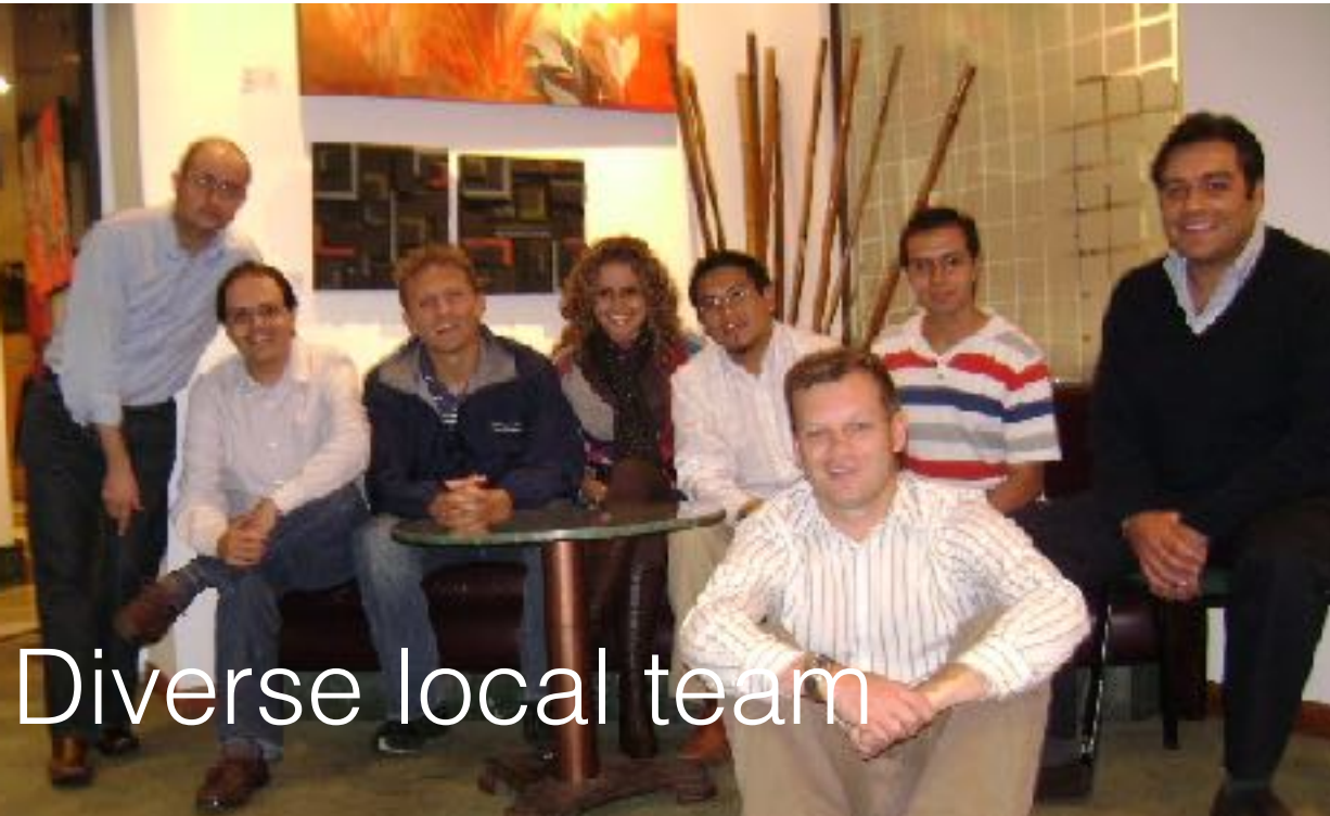
Diverse local team